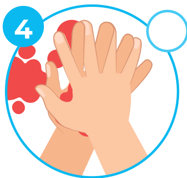
4 Rub between your fingers