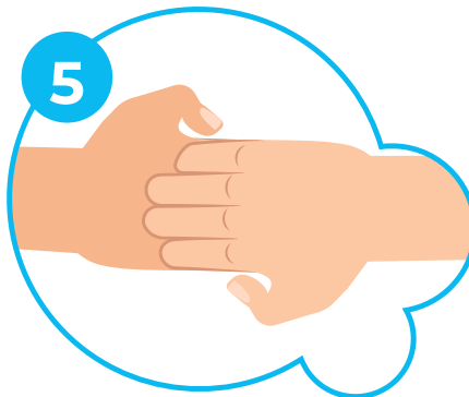
5 Clean the backs of your fingers