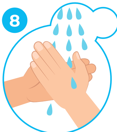
8 Rinse your hands