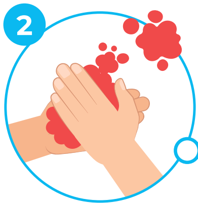
2 Rub your palms together