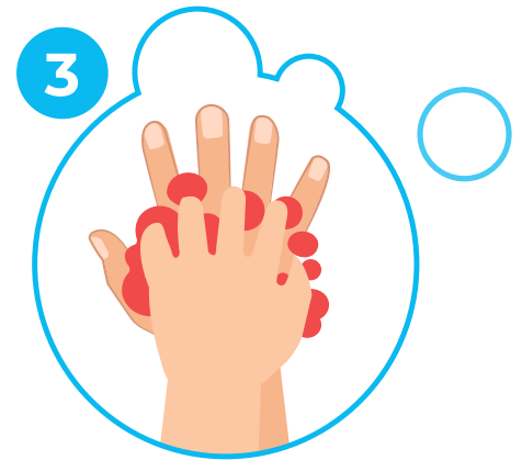
3 Rub the backs of your hands