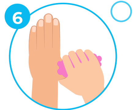
6 Rub your thumbs