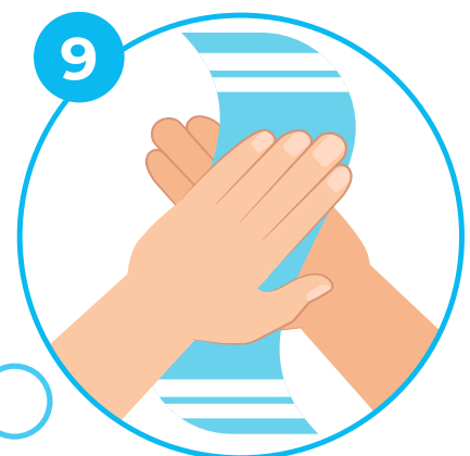
9 Dry them well