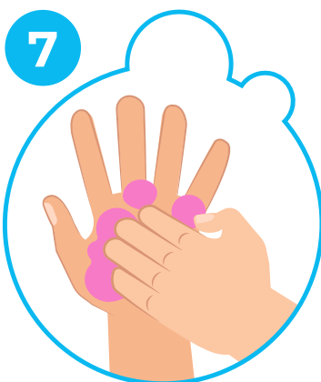
7 Clean your fingertips by rubbing them in your palms