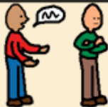
deliberately trying to hurt someone