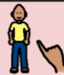
trying to control or harm someone