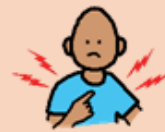
trying to harm someone's reputation