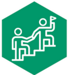
Leadership in STEM