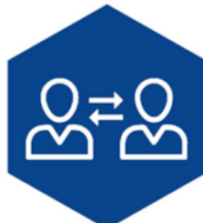
Employability and STEM partnerships