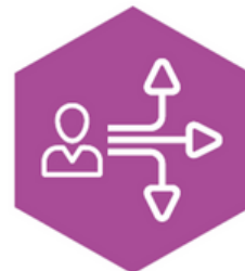
Curriculum and learner pathways