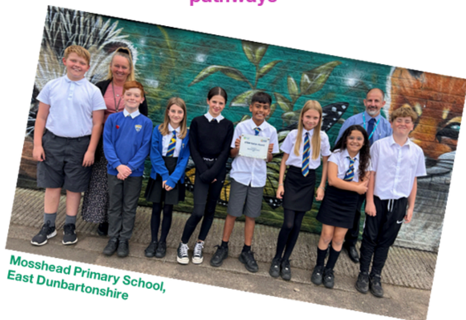
Mosshead Primary School, East Dunbartonshire