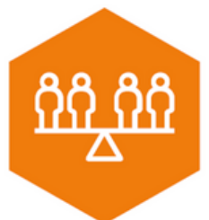
Equity and equality in STEM