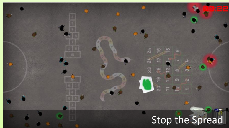
Stop the Spread