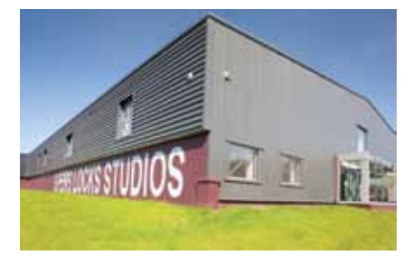
Speirs Locks Studios 210 Garscube Road Glasgow G4 9RR

Short Courses 0141 270 8213 Box Office 0141 332 5057 Switchboard 0141 332 4101 www.rcs.ac.uk