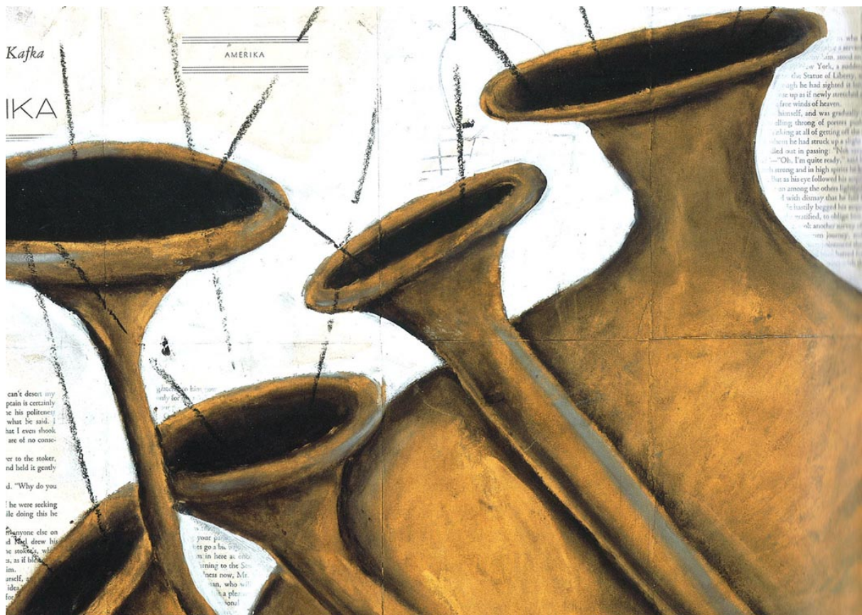
AMERIKA I (AFTER FRANZ KAFKA), 1984-5 (DETAIL)

Oil paint stick, acrylic, china marker, and pencil on book pages on rag paper mounted on canvas 71.5 x 177 inches