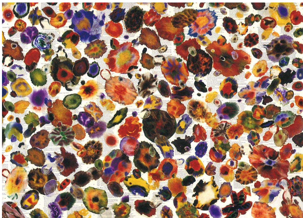
A MIDSUMMER NIGHT'S DREAM (AFTER SHAKESPEARE), 1999 Watercolour, aqaba paper, fruit juices, and mustard seed on book pages mounted on canvas 42 x 50 inches Des Moines Art Center, Des Moines, Iowa