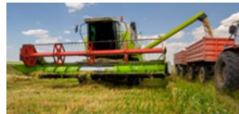
Animals, Land and Environment