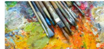
Art and Design