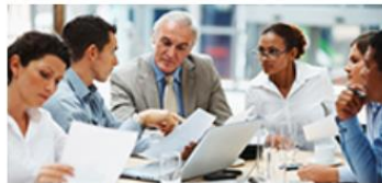
Administration and Management