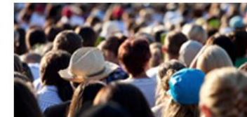
Arts, Social Sciences and Languages