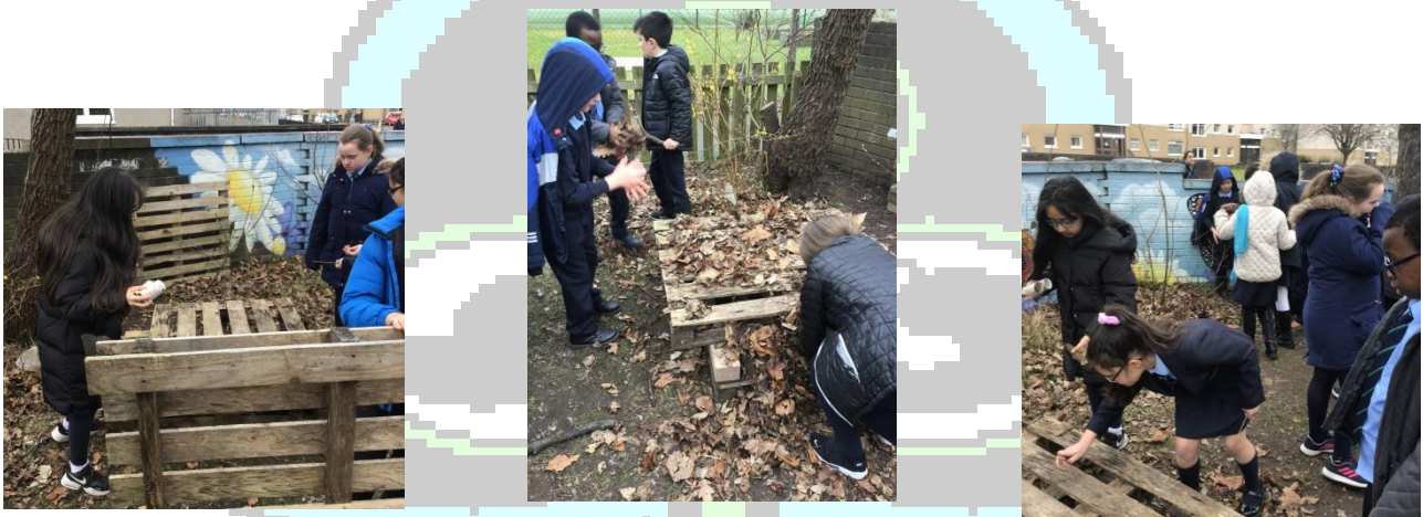
Primary 5/4 creating Bug Hotels in the Eco Garden.

Thursday 22 nd April - The Eco – Committee will be weighing all the litter collected and submitting our data to Keep Scotland Beautiful as part of our school action plan.