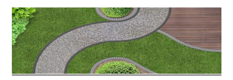
Developing Outdoor Spaces; Pathway

There is a 10% discount on all orders until the 7<sup>th</sup> of November. To save on deliver costs families can order together!