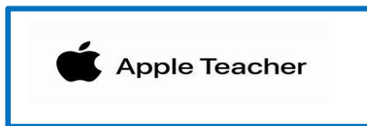
Apple Teacher Accreditation for all Staff