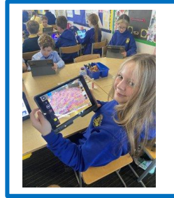
Digital Augmented Reality

The hard work of all our pupils and staff was recognised in June when the school received our Digital School Award .