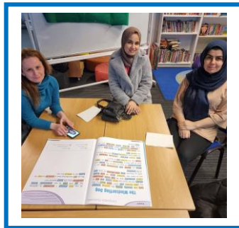
Supporting our EAL Families