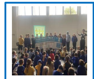
Silver Rights Respecting School Award

Here is what we plan to improve next year.