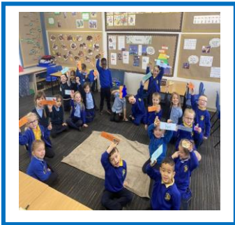
Primary 1 Phonics Pilot

Our Challenge Leaders of Learning (CLOLs) have built upon their work last year with staff, to build capacity and ensure pupils have high quality teaching and learning experiences in Numeracy and Literacy. They have continued to work with children in Targeted Intervention Groups to provide support to improve specific skills and knowledge, using current pedagogy and digital technologies. There have been increased opportunities for parents/carers to work in partnership with staff to support their children.