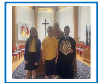
House Winners Jura