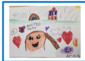
Pupil Support Groups