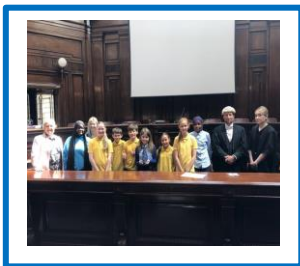
Primary 7 Winners at Mock Court

The children have been provided with opportunities to participate in a range of activities to enhance their curricular experiences and develop lifelong skills for learning and work. They have worked with a range of partner agencies to provide varied and motivating experiences. There has been a lot to celebrate this year and we have been proud to invite our families and the local community into the school to showcase the children and their work.