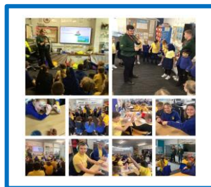
Developing the Young Workforce Partnerships