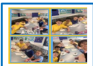
Hot Chocolate Friday