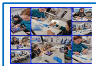
Family Support Groups