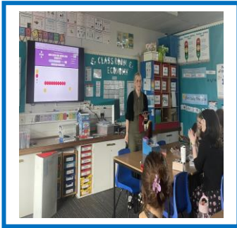
ENP and Mainstream Staff Learning Together

Our ENP continues to thrive. We have offered targeted support to children with social and emotional difficulties from across the city. In addition, Sandaig children have received support from the provision to help regulate their feelings and emotions; fostering a more positive, inclusive and safe learning environment. ENP staff and mainstream staff work together to provide the best outcomes for our children. This has contributed to enhanced overall wellbeing amongst the children of Sandaig and a calm, caring supportive school ethos.