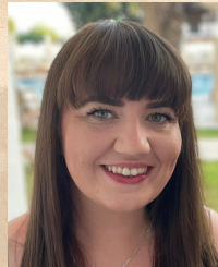
Miss Cunningham Class Teacher

The children look very smart in their uniform. Please ensure that your child's name is clearly marked on all clothing, including gym clothes and jackets.