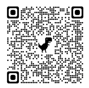
Free to attend Book via QR Code

Bridgeton Library, Saturday 11th February, 2pm, Ages 3-8, Ticketed-Free