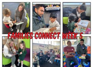
FAMILIES CONNECT WEEK 5