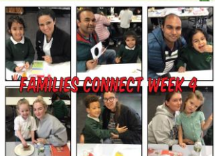
FAMILIES CONNECT WEEK 4