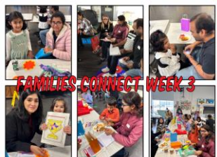
FAMILIES CONNECT WEEK 3