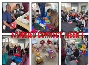
FAMILIES CONNECT WEEK 1