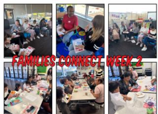
FAMILIES CONNECT WEEK 2