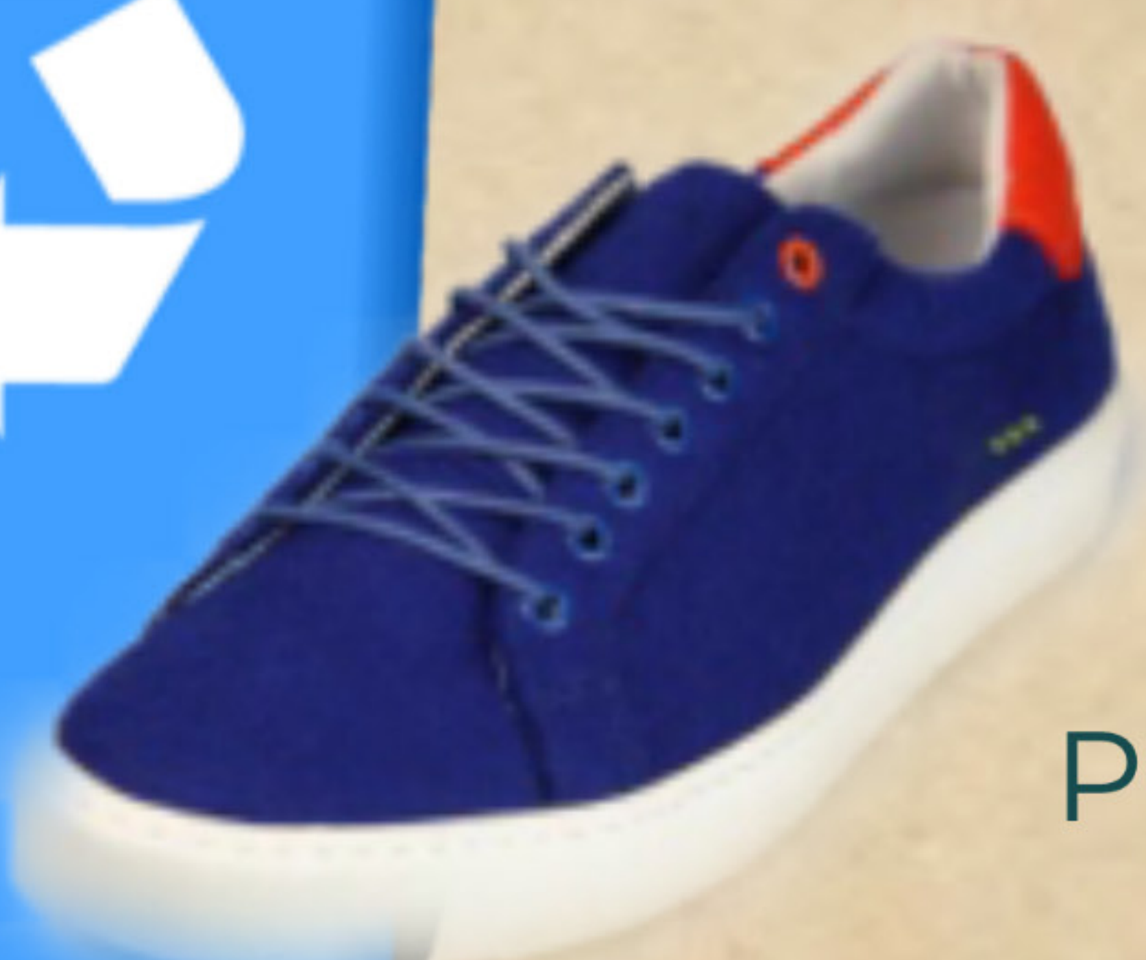
Part 3 - hit bin with a shoe