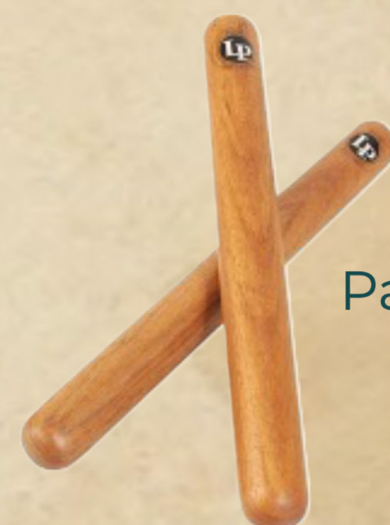
Part 4 - claves or drumsticks