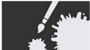
Art and Design