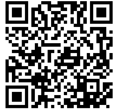
CEOP (Child Exploitation and Online Protection)