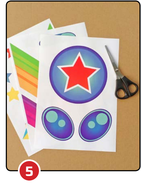
Cut out all the details from the templates provided.