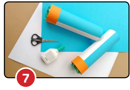
Making The Turbines Get two plastic bottles (we used 1.5l bottles). Cover one side in white coloured card and the other side in blue. Next glue an orange strip around the base of the bottles as shown.