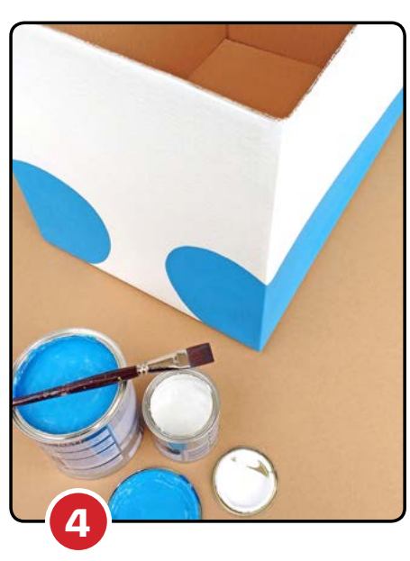
Next paint the box white and blue