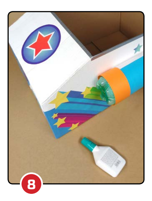
Glue the turbines to each side of your Vroomster. Using the duct tape, cover the edges of the box opening.