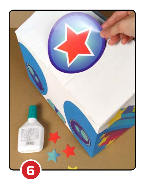
Decorate your Vroomster with all the template details.