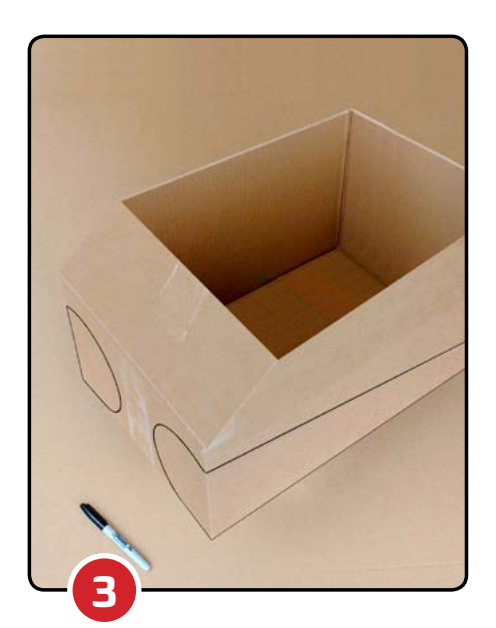
Using a marker draw along the sides and front, as shown.

2. Fold in the front flap and glue or tape in place.