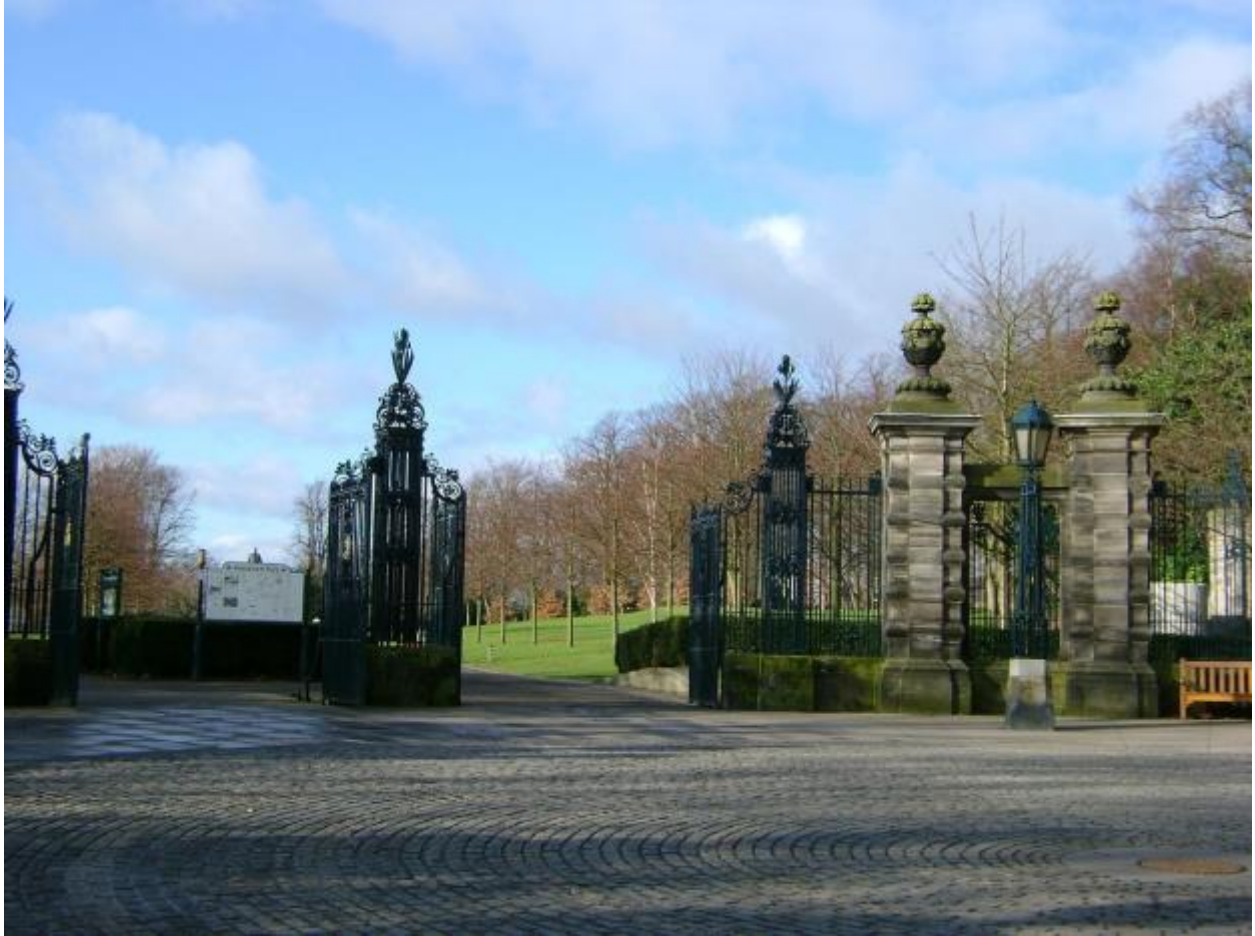
3 - Our location and the opportunities it affords us enrich the learning experiences of our children