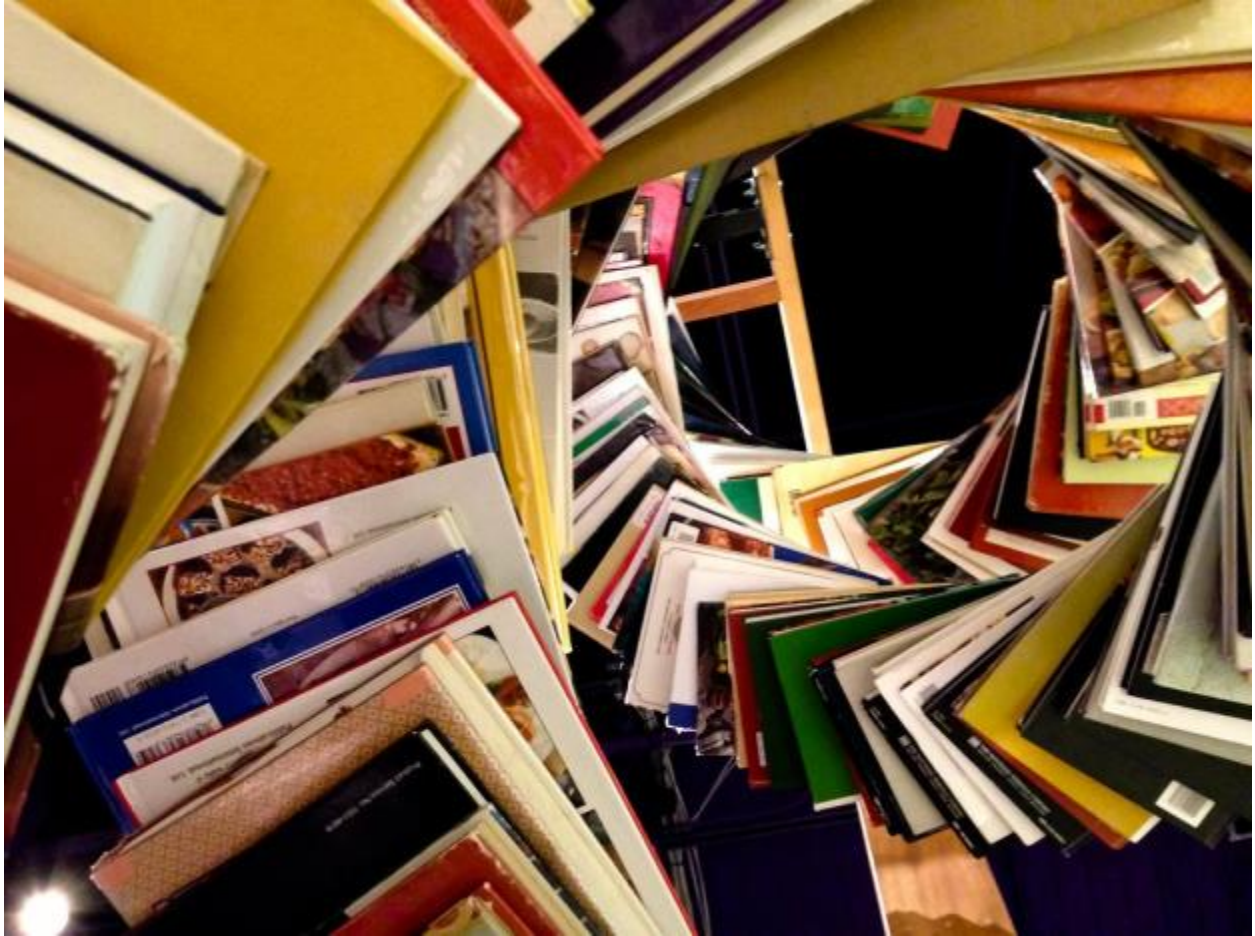
2 - The accelerated reading programme provides a clear progression framework and keeps reading high on our priorities