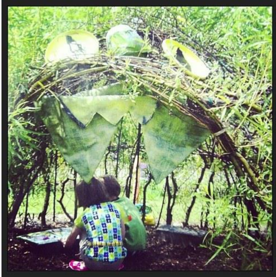
1 - Outdoor Learning was identified as a key element of our curriculum which runs from nursery to P7