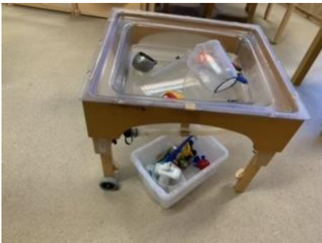
This is the water tray, you can pour, splash, measure and explore