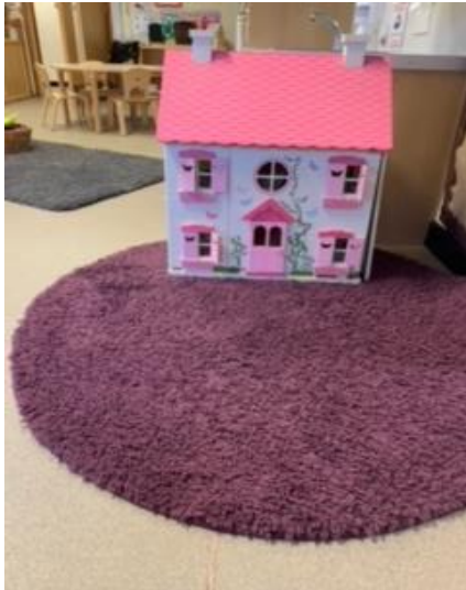
You can play with the doll's house