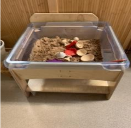
This is the sand tray where you can build, dig and explore