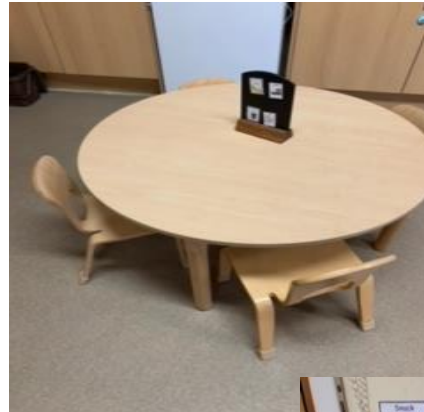
We can sit together for a snack