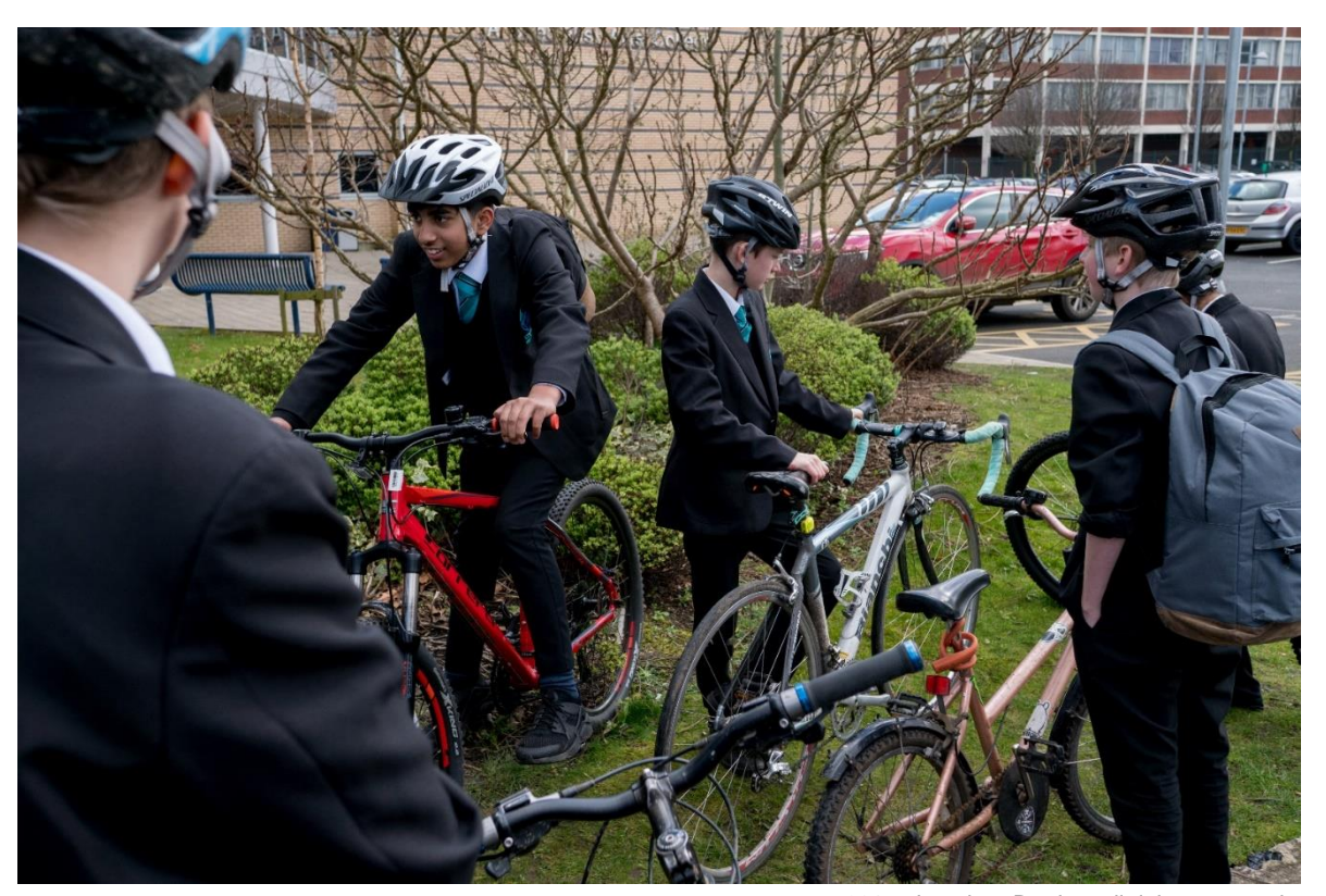
2017, Jonathan Bewley, all rights reserved