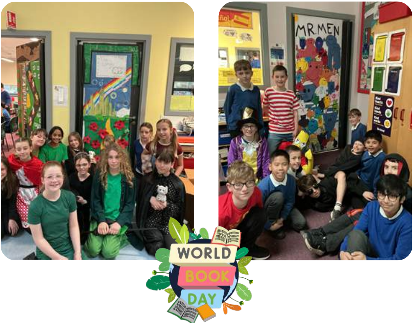
Winning door design - P6a girls 'Wizard of Oz' and runners up P6a boys 'Mr Men'