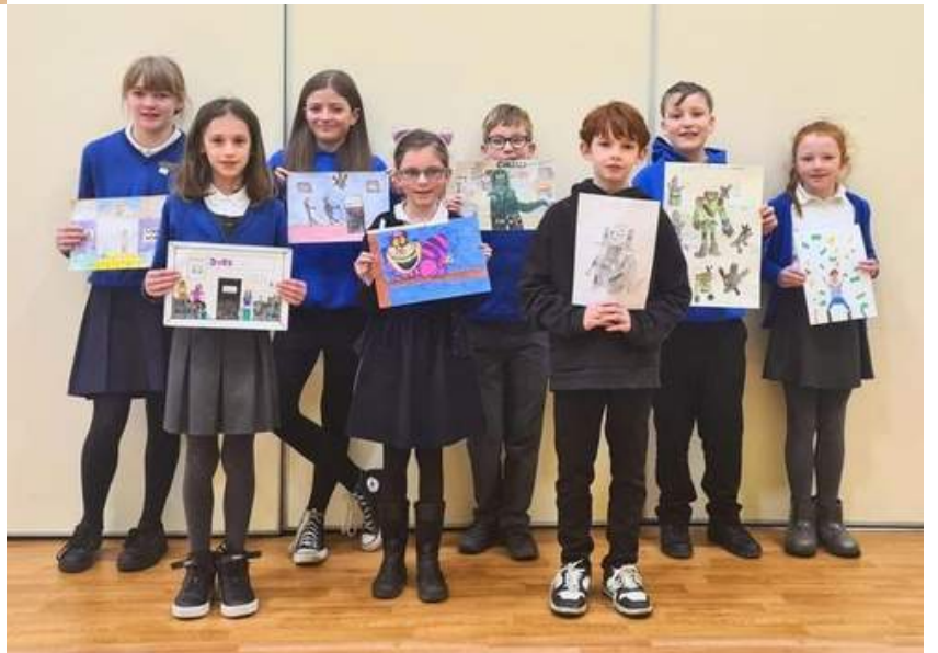
Primary 4 - 7 Winners