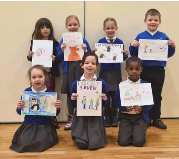
Primary 1 - 3 Winners