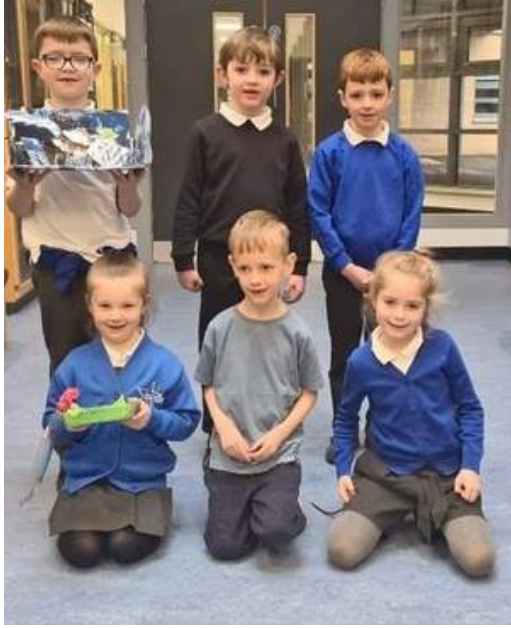
Primary 1 - 3 Winners