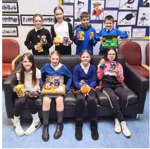
Primary 4 - 7 Winners