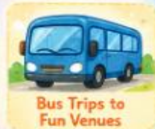
Bus Trips to Fun Venues