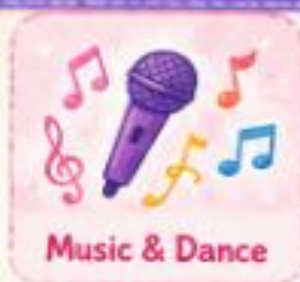
Music & Dance