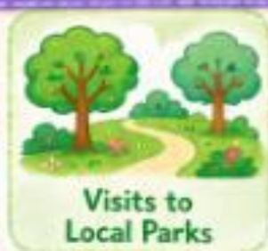
Visits to Local Parks