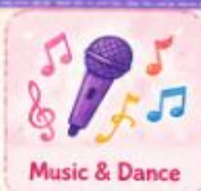
Music & Dance