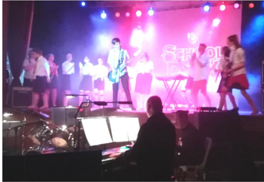
Our Smash Hit Musical; School of Rock