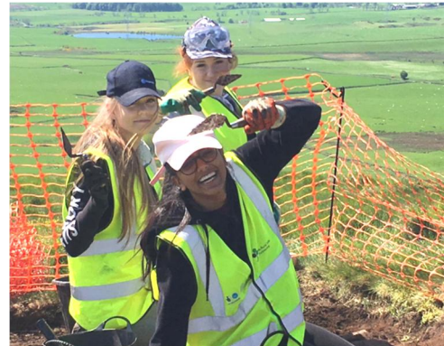
Iron Age Dig in the Lomond Hills