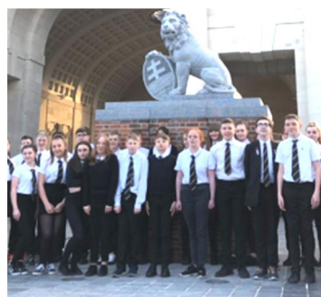
At The Menin Gate, Ypres