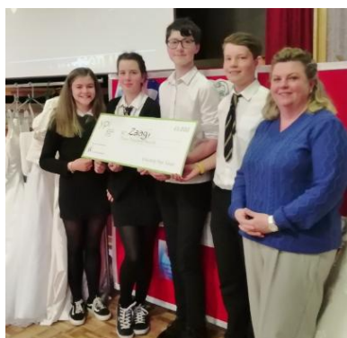
"Zaagi" £3000 Charity Prize