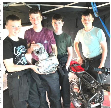
Motorbike Maintenance Squad at Work

Sustainable Development Goals. We have been heightening awareness of the importance of protecting our environment and of the dangers of pollution and climate change. As you are aware, governments around the world are recognising that we need to do things very differently to combat the "climate emergency". As well as this being the theme of much of the learning across S1-3, it was the basis of lessons for the Primary 6 visits for a taster day on the Tuesday. On Wednesday, the Modern Studies Department arranged a visit to Kirkcaldy Sheriff Court, part of their learning about law, order and justice. We also had staff attending