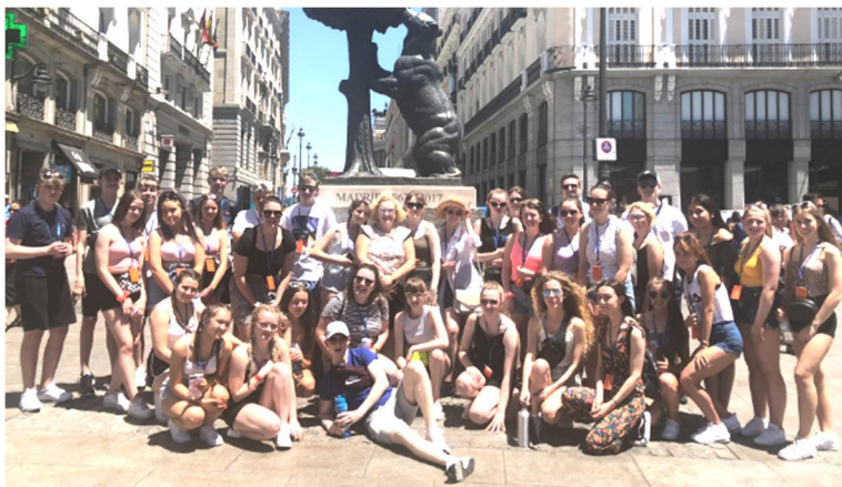
KHS Languages; Cultural Trip to Madrid, 2019

The week's highlight was undoubtedly our Spanish language trip to Madrid, which left school on the Monday. Many thanks to the staff team