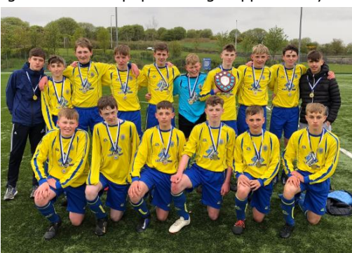
U15 League and Cup Double Winners