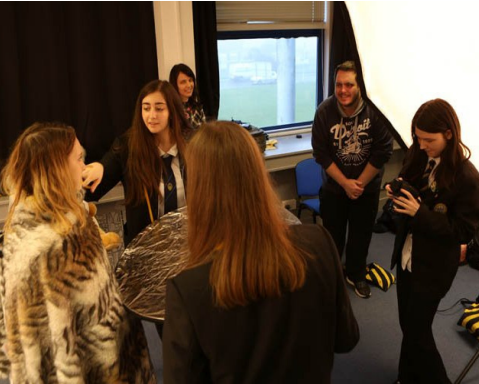
The Higher Photography Class at the Charter Studio

The week closed with a Business Education trip to the Investment