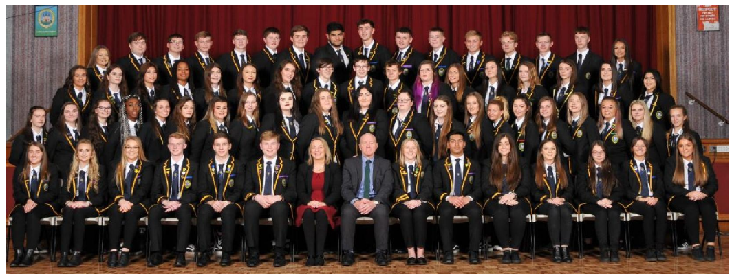
KHS Prefect Team 2017-2018. The team has made a very good start to the session.