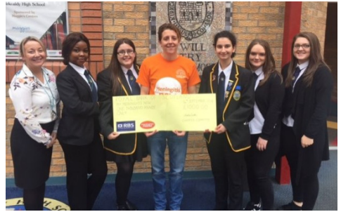
£1000 Donation to Meningitis Now

Letters have been sent to our associated primaries: Cap-