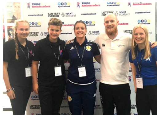
KHS Sports Ambassadors

After the short week at the start of term in which we involved young people in activities to settle back in to learning, we held three House Assemblies in week beginning 22 Aug; Adam Smith on Tuesday, Carlyle on Wednesday and Oswald on Thursday. It was a chance to welcome the First Years and introduce the new House Captains - the S6 leaders who were elected by their peers to help organise events and competitions.