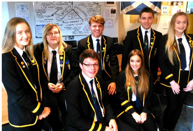
Our New Prefect Leadership Team 2016/17