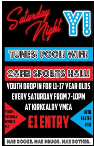
Saturday Nite "Y"