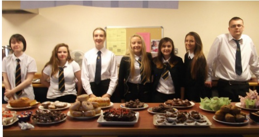
MacMillan Charity Coffee Morning

On Thursday, our "Personal Development" class organised a fund-raising coffee morning for the staff in support of MacMillan Cancer Care and the magnificent total of £207.20 was raised for this excellent cause. It was great to