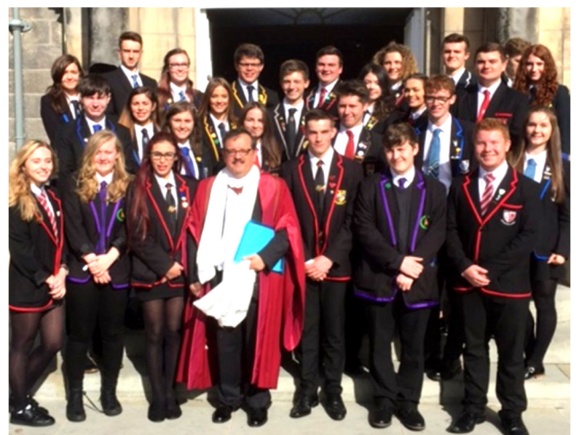
Signing the Declaration of St Andrews