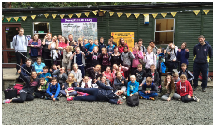
Fordell Firs Camp for First Year

The "Declaration of St Andrews" saw representatives of the Pope and the Dalai Lama joining senior members of the other Christian churches, Hindu communities in the UK and India, and the Jewish