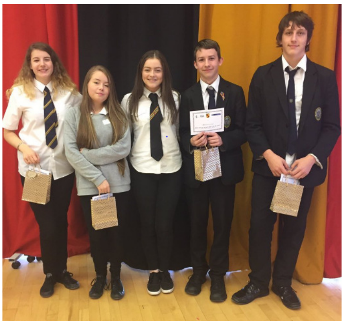
Enterprising Maths - KHS are Scottish Finalists

Rising through the ranks at KHS, she has been Business Manager