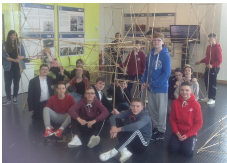
Engineering Science Trip to the new Forth Crossing at Queensferry