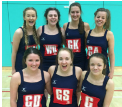
Our Senior netball team enjoyed a best ever finish at the Fife Championships in March