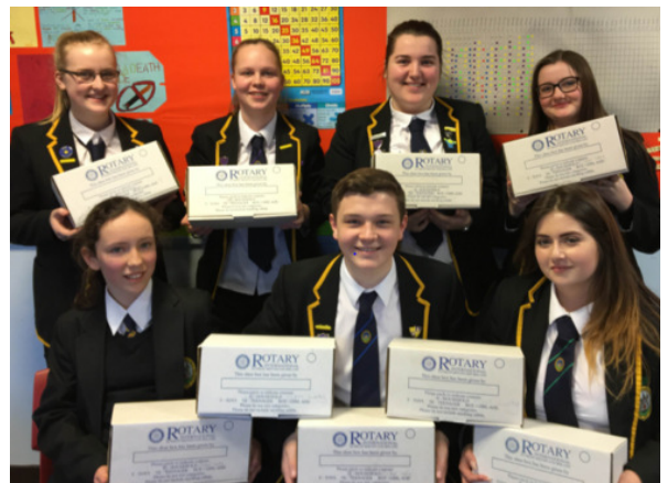
Our Rotary Interact Club once again supported the "Shoebox Appeal"