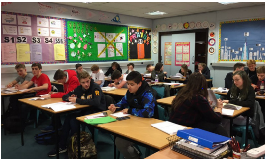
Saturday School and Easter Study Support has been very well attended