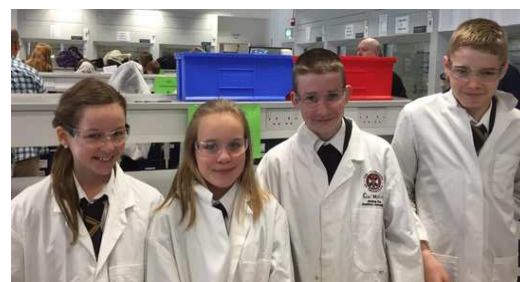
S2 at the Salter's Chemistry Festival, Heriot-Watt University