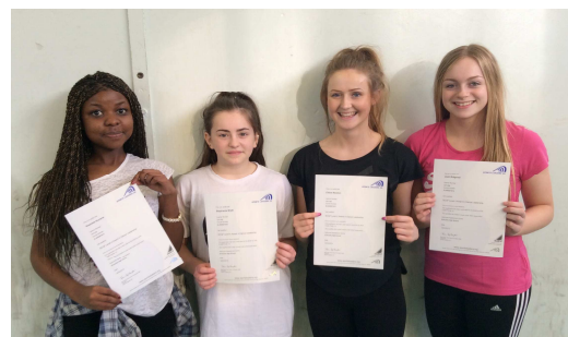
S2-4 Dance Leaders Achieve Level 1 Award