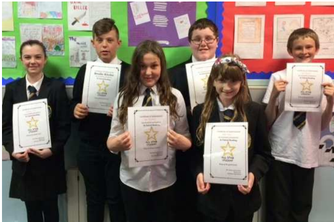
S1 Readers proudly show off their certificates after participating in our S6 Paired Reading programme. The S6 volunteers are thanked—they also qualify for a Saltire Volunteering Award.