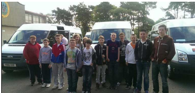
Heading Off Bowling

Next year we also intend to give pupils who have followed our "ABOUT" Code (Attendance, Behaviour, Organisation, Uniform and Timekeeping), the first chance to take part in the most popular activities and trips. More details of this will be issued soon.