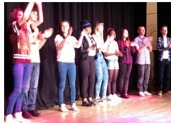
The Grand Finale