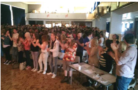
The Crowd Goes Crazy