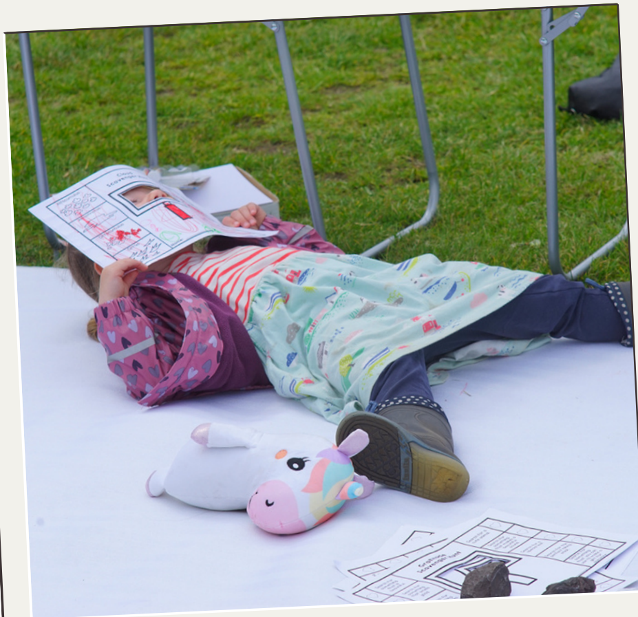
#49 Grass Gazing

“With the poster, we can show the children and they can interact and point out the pictures that they would maybe like to talk about [...] and activities that we could do.”