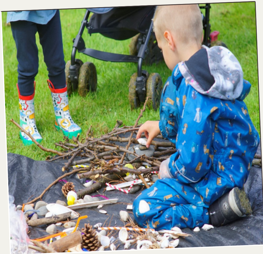
#48 Natural Art

In Scotland, policies around children, families, and education highlight the importance of play in learning and development. Outdoor play is promoted within the National Play Strategy , and is woven through play based curriculum content in the early years.