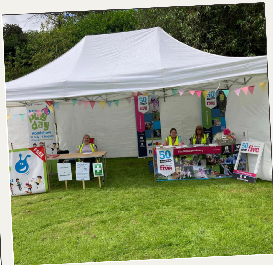
50 Things Marquee

Attendees were directed to a 50 Things marquee where they were encouraged and supported to download the App, given a 50 Things ball, and were given the opportunity to win a hamper!