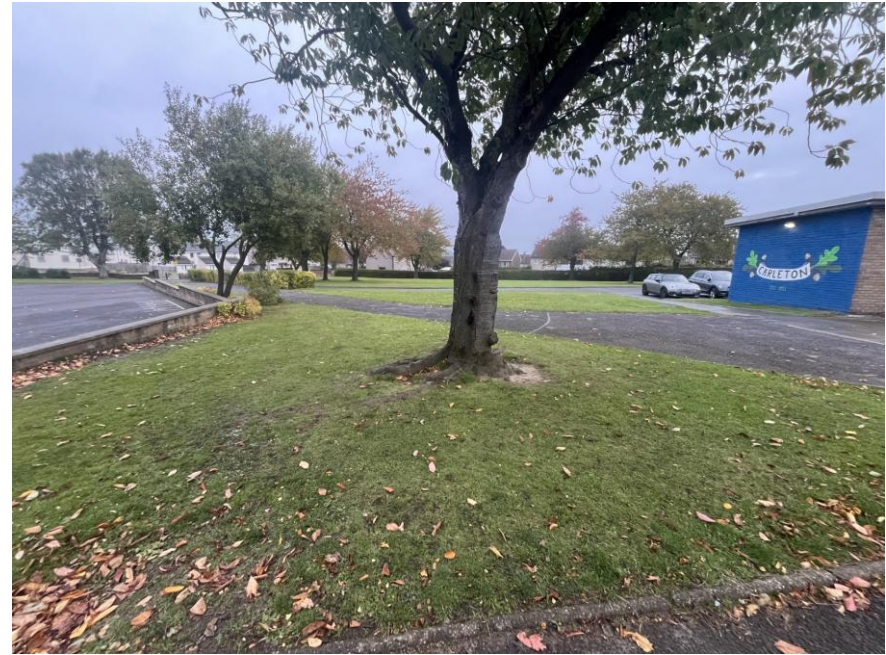
Grass at top of path.