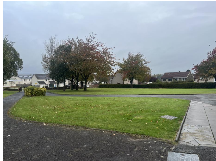
Grass area at car park.