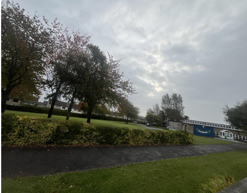
Path, hedge and grass.