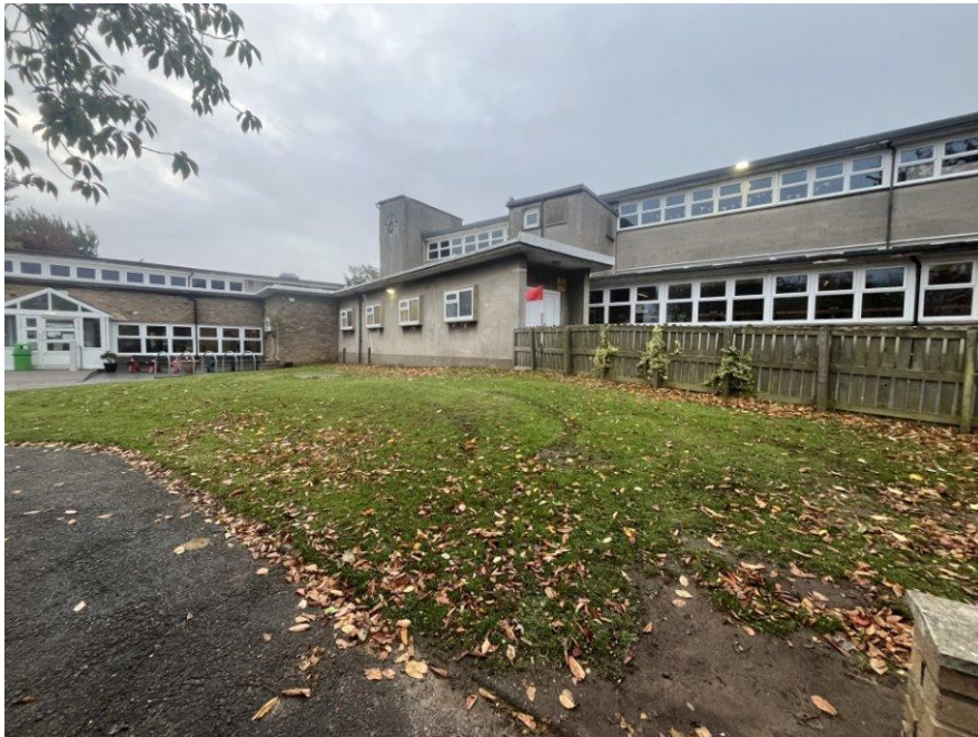
Grass outside boys toilets.