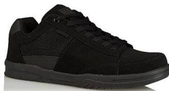
Plain black trainers