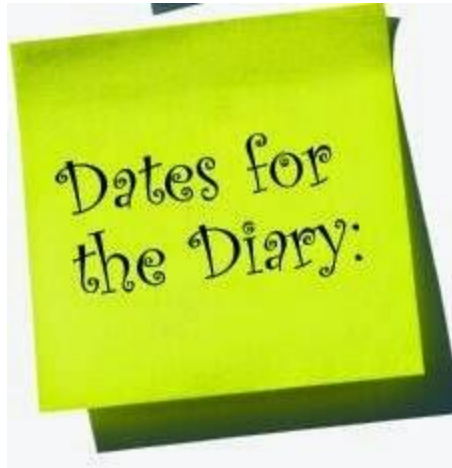
9 - Important Dates

https://www.theredcard.org/news/2021/creative-competition-scotland