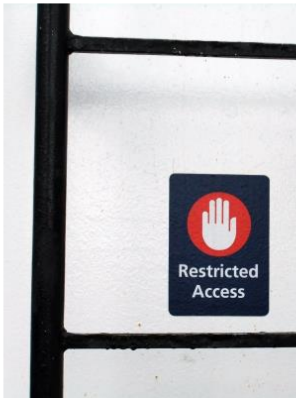
6 - Parental Access into School Buildings

All school lunches will now be served in the dining room. Please pay for meals using the i-pay system to limit the number of adults coming into the building and also to cut down on the handling of cash (both measures to prevent viral spread). Please also try to help your child choose their meal using the system, even if you do not pay. This cuts down on the unnecessary admin time the teacher spends sorting out lunches when they could be teaching.