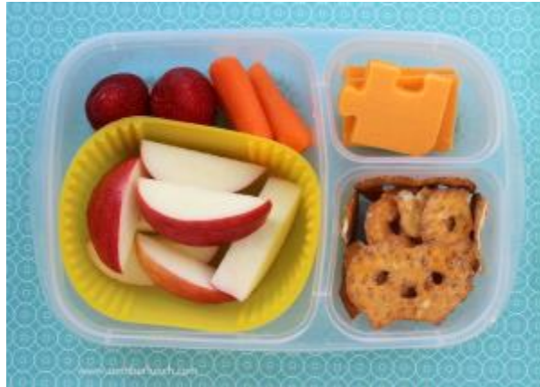
5 - Lunch Provision

All school lunches will now be served in the dining room. Please pay for meals using the i-pay system to limit the number of adults coming into the building and also to cut down on the handling of cash (both measures to prevent viral spread). Please also try to help your child choose their meal using the system, even if you do not pay. This cuts down on the unnecessary admin time the teacher spends sorting out lunches when they could be teaching.