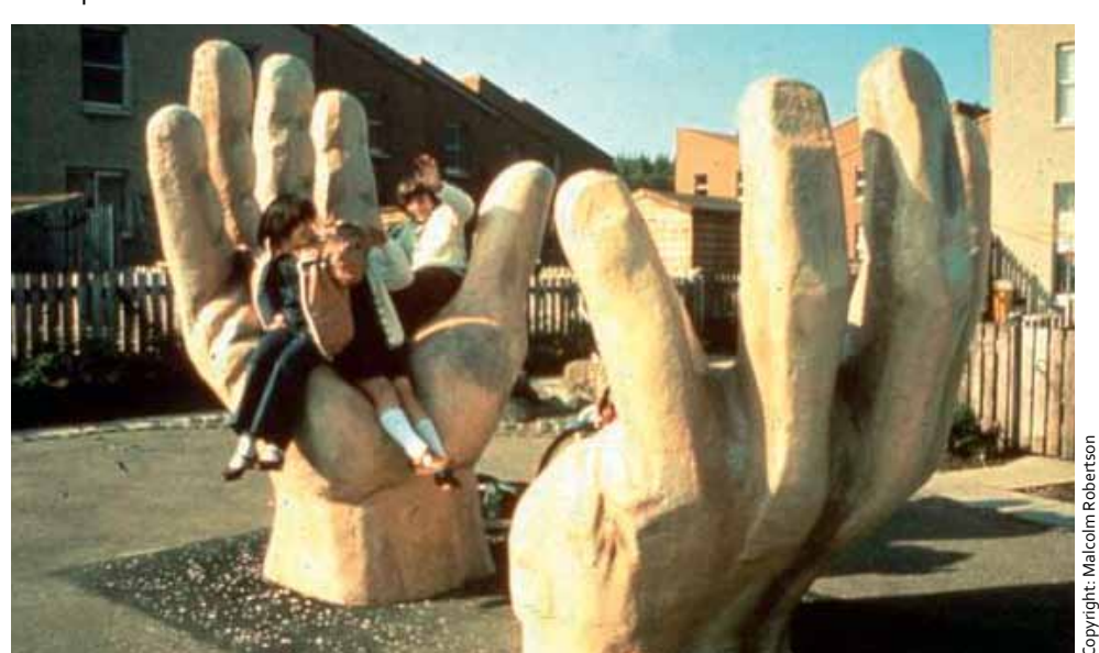
'Giant Hands', Collydean (1980)

economic focal points for Central Scotland. The Glenrothes Development Corporation was successful in attracting modern electronics factories to the town and during the mid-1970s, the town also became the headquarters of Fife Regional Council. Today, it is the administrative centre for Fife. The ongoing programme of public art in Glenrothes throughout this period of change helped establish an individual identity for the town as it adapted and evolved.