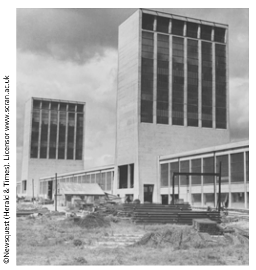
Construction of the Rothes Colliery (1956)

Glenrothes was not intended to be a Glasgow overspill town, although it did later take this role. It was populated in the early 1950s by mining families moving from the West of Scotland and the declining Lothian coalfields who were to work at a new super coal mine in the area. This 'Super Pit' was named the Rothes Colliery and was officially opened by the Queen in 1957. At its peak it employed over 1,500 miners. However, in 1961 the mine closed as a result of unstemmable flooding and geological problems.