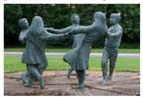
Cast in bronze in 1989, an exact replica of 'the Dream' by Malcolm Robertson was gifted to Glenrothes' twin town of Böblingen in Germany