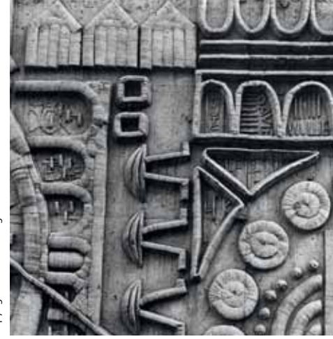
The names of builders who helped are immortalised in concrete