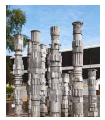
'Heritage' (1976) by David Harding consists of 14 white concrete columns representing architectural styles of earlier cultures including Egyptian, Greek, Roman, Inca and Aztec