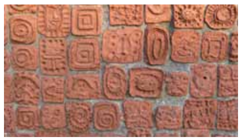
Detail of the patterned tiles (2011)

From the beginning, the town's first artist, David Harding (1968-78), considered it important to involve local people in the creation of the work. For example, groups of primary school children modelled their own ceramic tiles and cemented them onto walls near their play areas. Many of the sculptures were quickly adopted as local meeting places and, in some cases, games developed around them.