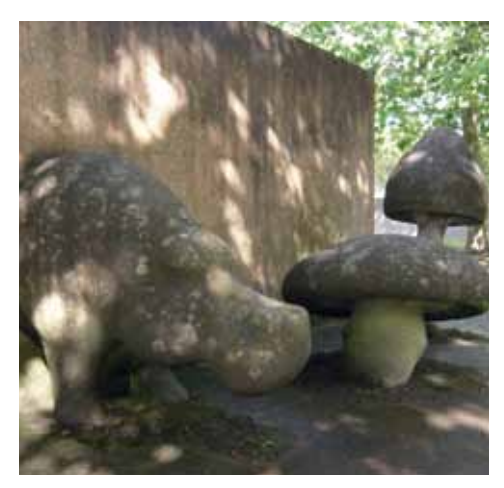
'Death of the Hippo' – A wall halves a solitary hippo surrounded by mushrooms in Woodside (1977)