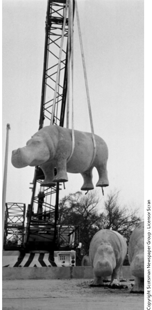
The 'Thirsty Hippos' are lowered into place in the Riverside Park paddling pool (1976)