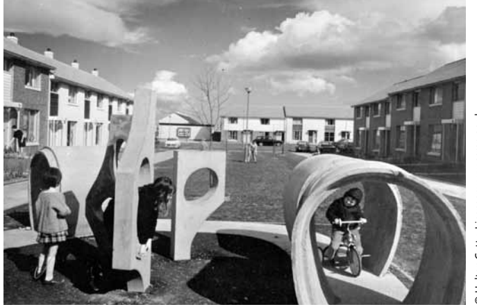
Playing in the Pipe Tunnels in the Newcastle precinct (early 1970s)

Careful consideration was given to the form and infrastructure of the town, focusing on individual suburb neighbourhoods (known as precincts), each with their own architectural identity. Engineers, builders and architects were tasked with creating not only good quality