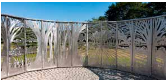
'Forest Screens' (1990) by Malcolm Robertson uses industrial materials to depict natural forms – a recurring theme