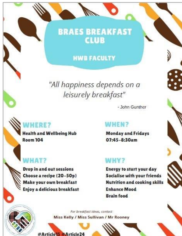
3 - #RRSA #Article 24 - the right to the best health possible