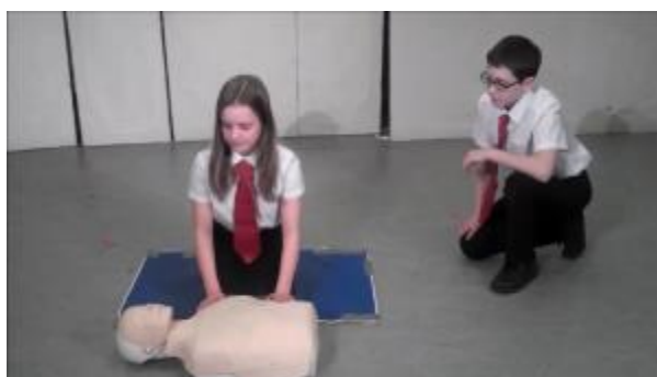
2 - video