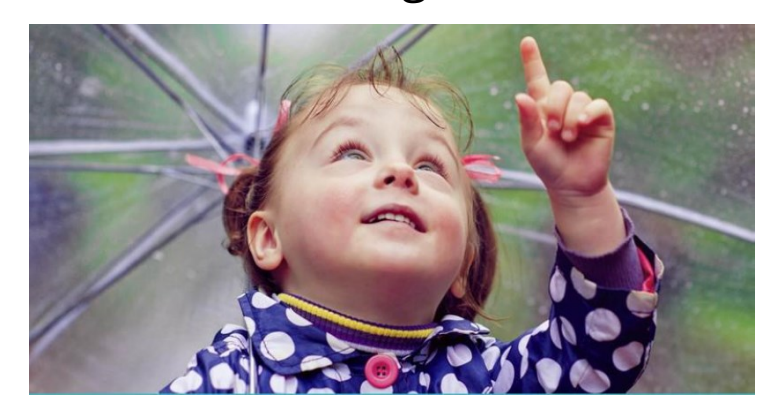
Venue Camelon Early Learning & Childcare Centre Nailer Road Falkirk FK1 4DA

Early years' ASN parenting programme for parents/carers of children aged 2 to 5