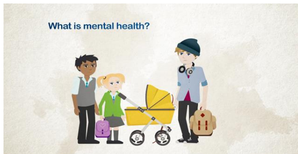
What is Mental Health