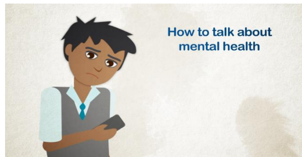
How to Talk About Mental Health