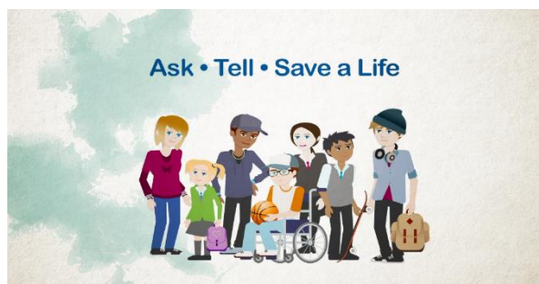
Self-Harm and Suicide Prevention