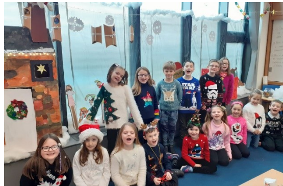
Clas 3-4 air beulaibh na h-uinneig aca.

tomhas 'Cò am bèibidh?' agus 'Cuir am brèid san àite ceart air Pudsey'. Dh'ionnsaich sinn cuideachd mu dheidhinn Guy Fawkes. Bha Elf air an sgeilf a' crostachd sa chlas againn. Tha pàr-taidh na Nollaig gu bhith againn anns na clasaichean againn fhèin air an latha mu dheireadh. Tha sinn air bhoil air a shon. Chòrd e rinn na seudaireachdan crèadh a dhèanamh airson an craobh Nollaig agus chòrd e rinn uile a bhith a sgeadachadh na h-uinneagan againn. Bha e math cairtean bodach sneachd, sèinichean pàipear agus seudaireachd Rudolf a dhèanamh. Ged a bha tòrr spòrs againn, cha do chòrd e rinn mòran a bhith ag obair air an sleigh/taigh airson an uinneag oir bha am PVA ro steigeach agus bha e a' dol anns a h-uile àite. Nuair a bha sinn ag obair air an Grinch bha na làmhnan againn a fàs sgìth a' cur dath.