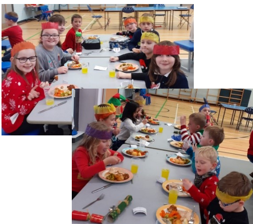
P1-4 enjoying their Christmas lunch.