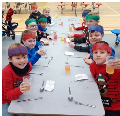
Some of P5-7G having their Christmas dinner