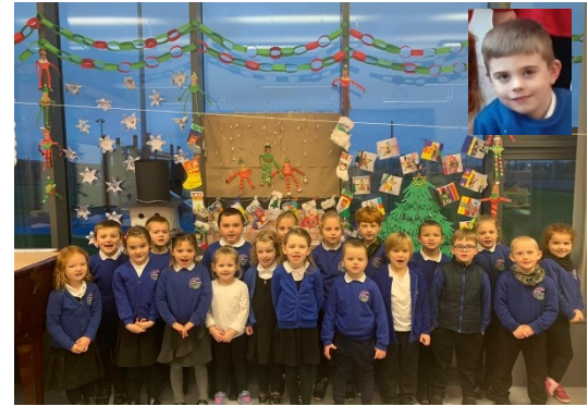
Clas 1-2 air beulaibh an uinneag aca.