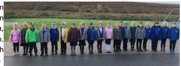
Cò as àirde ann an clas 1/2?