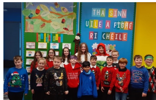
P5-7G in their Christmas jumpers