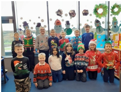
P1-4E with their Christmas window.