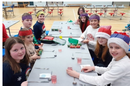
Some of P5-7E enjoying their delicious Christmas lunch