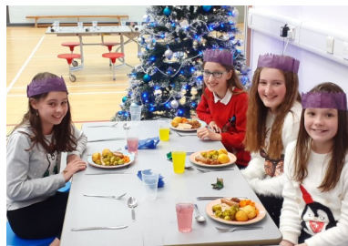
P7 girls enjoying their delicious Christmas lunch