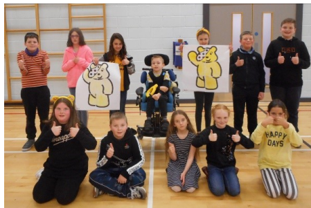
P5-7E on Children in Need Day wearing yellow!

The story begins where Comet and the fox are introduced in the mountains and trees. Before the fox and Comet met, Comet couldn't fly because people's hearts weren't warm enough and the fox said that people were upset. Because Comet couldn't fly they had to walk a long journey of 145 miles to Lapland, which is what we aim to do. Each class is taking part in a window display competition. We filled our windows with presents, Santa and lots of Christmas fun things. The competition is just for Sgoil An Taobh Siar. In school all of the classes have been doing lots of arts and crafts like making Rudolph and painting Christmas trees. This term we had a Teams online meeting with SEPA, who look after the environment. They spoke to us about flooding. They said that you can put special bags outside your door when a flood comes and they put a flood warning out when a flood is coming. The upper classes really enjoyed it.