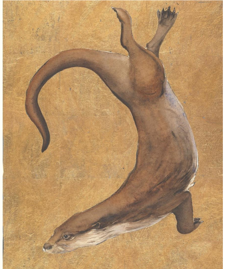
© Robert Macfarlane & Jackie Morris, The Lost Words

Run to the riverbank, otter-dreamer, slip your skin and change your matter, pour your outer being into otter – and enter now as otter without falter into water.