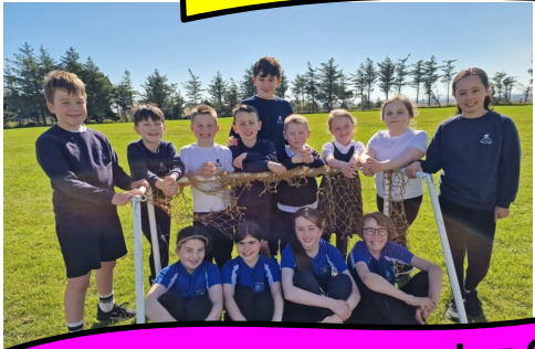
Rights Respecting Steering Group