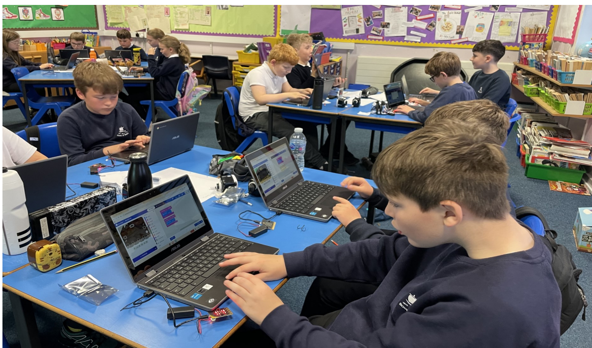
P6 and P7 pupils using Microbit coding software to create their own codes.

We hope you find all of the information helpful and self explanatory. If you have any queries about any of the information contained in this handbook, or indeed about any aspect of our school, please do not hesitate to contact the school.