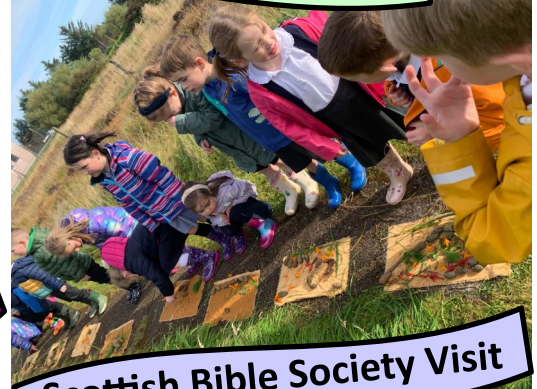
Scottish Bible Society Visit