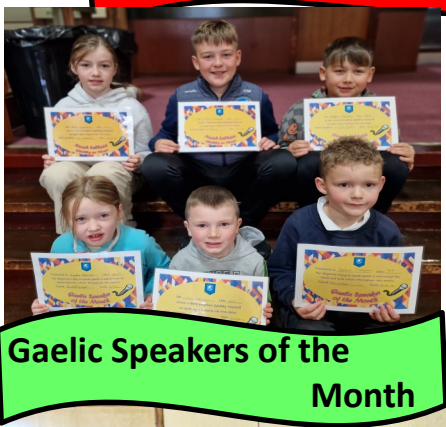
Gaelic Speakers of the Month