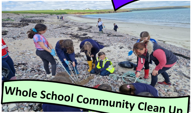
Whole School Community Clean Up