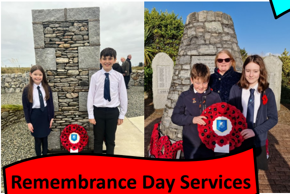
Remembrance Day Services