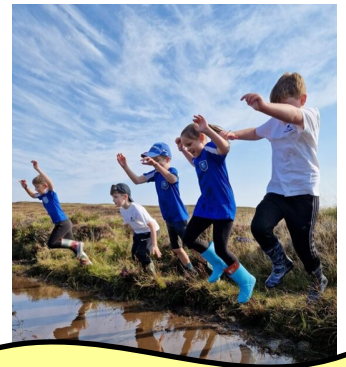
Sponsored Bog Slog