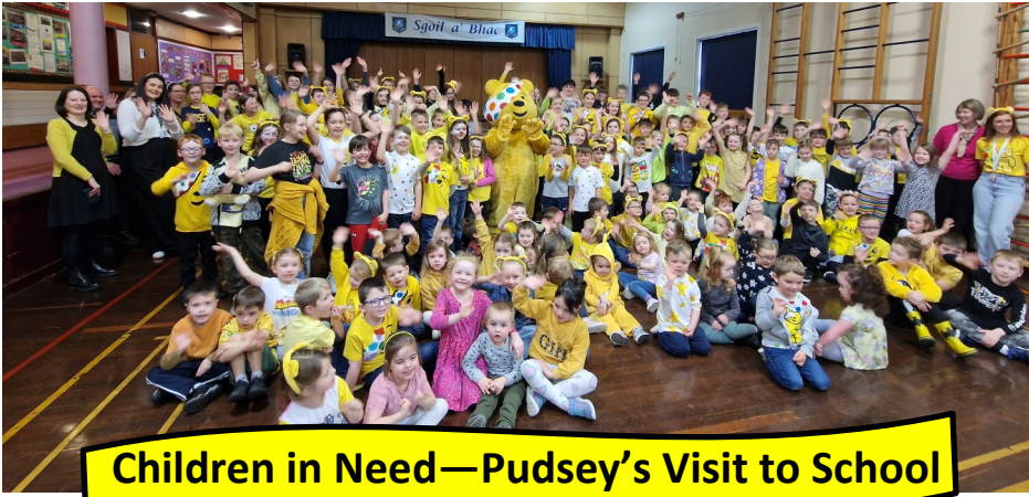
Children in Need—Pudsey's Visit to School