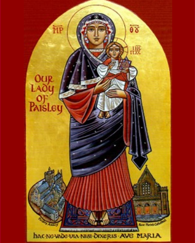
Our Lady of Paisley; pray for us