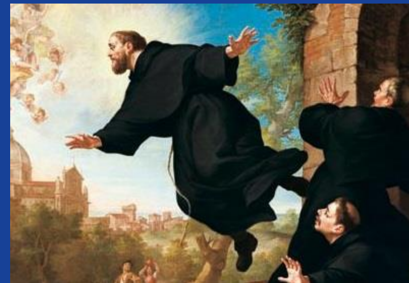
St Joseph of Cupertino is the Patron Saint of students and exam takers.