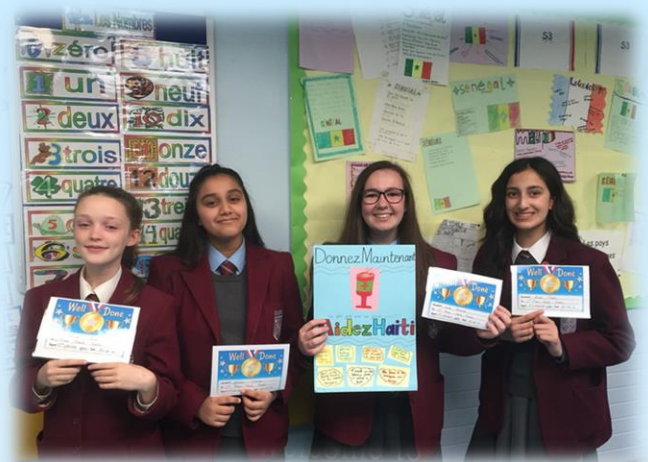
St Ninian's High School