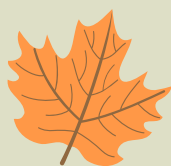
An orange leaf

Get ready to explore the outdoors and discover the beauty of the fall season!