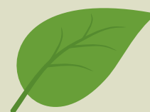
A green leaf