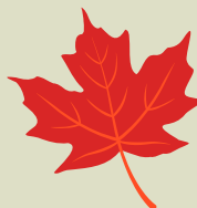
A red leaf