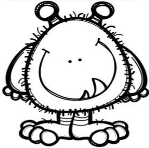
Harry the Monster