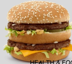
HEALTH & FOOD

Write the proportion of lost sales as a fraction in its simplest form.