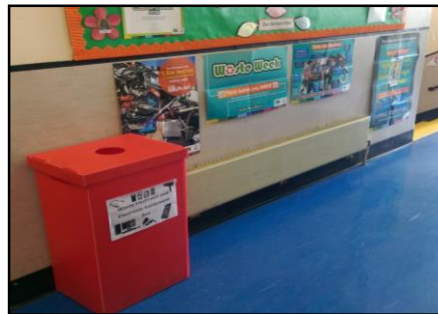
WEEE bin with a learning wall about at our Eco Noticeboard. The children took photos of recycled items.