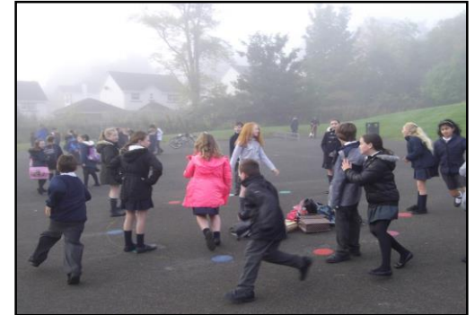
P 5 – 7's enjoying their new playground games first thing in the morning!