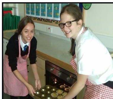
Making Big Breakfast muffins in Home Economics

In September 2019 40 pupils participated in the event as part of the STV Children's Appeal. After tucking into a wide range of cereals, toast and juices, courtesy of Morrisons, Newlands, pupils were entertained by our own Mr Yates. There followed an interactive quiz with the morning concluding with a healthy walk around the school.