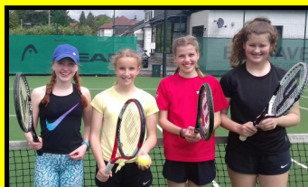
A day out at Giffnock Tennis Club